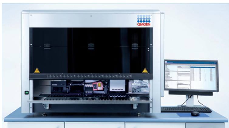
Figure 1. The STAR Q Swab AS instrument.

QIAGEN GmbH, QIAGEN Straße 1, 40724 Hilden, Germany